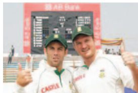
Graeme Smith and Neil McKenzie