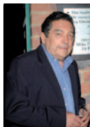
Dr. Ali Bacher

The spirit of the School is typified in the motto 'Strenue' which requires that educators and learners commit to the ethos of the School with all their energy.