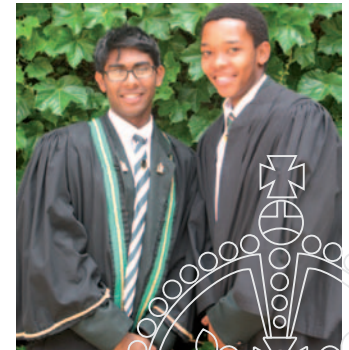
Johannesburg Junior Council