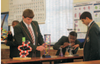
Experiments in Science Laboratory