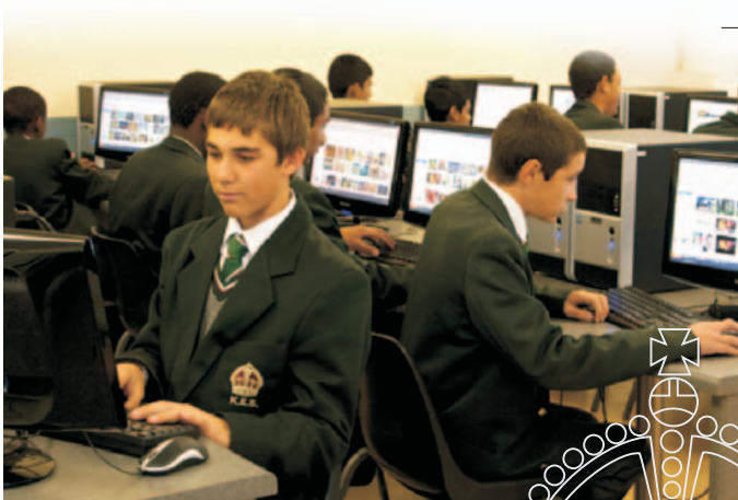
Learners at work in the computer centre.