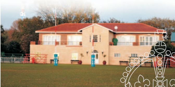
Rob Wray Pavilion